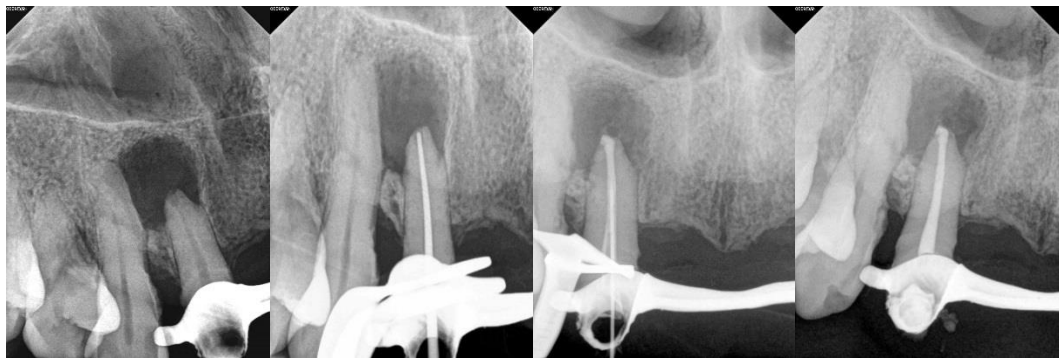
An upper lateral incisor with a long standing infection. The blunted root tip indicates root resorption and lack of a natural constriction at the apex. Size 45/04 gutta percha shows that it may not create an adequate apical seal. The canal was taken to size 70 using a LightSpeed system (0 taper, parallel instrument) and filled with a matching SimpliFill gutta percha obturator. Alternatively, the apical 1/3 of the canal could have been filled with MTA.